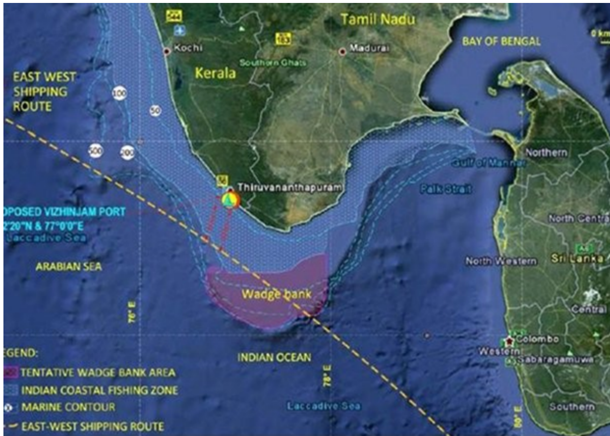
Location of Wadge Bank with respect to Project site

The 120-year-old St Anthony’s Church on the island attracts devotees from India and Sri Lanka for an annual festival .